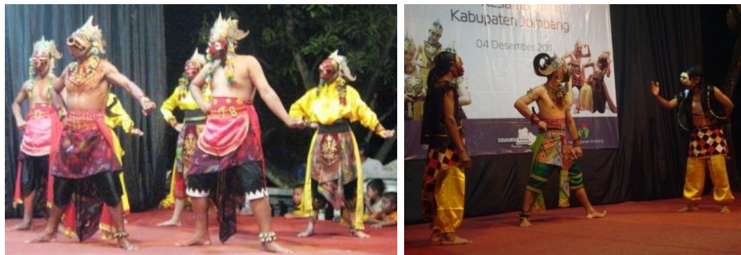
Figure 1: Jatiduwur Mask Puppet Performed

But, this rules had a great cost. 2011, at the Pendopo Jombang Regency, was the last year Jatiduwur mask puppet shown in public. Currently, its existence is nowhere near popularity. The Jatiduwur mask puppet has already forgotten. Revitalization should be taken to make this local art alive, so that the younger generation could recognize the Jatiduwur mask puppet as a culture richness Indonesia have, especially for Jombang, East Java.