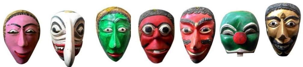
( Pictured by Prayogo, 25 Januari 2015)